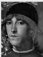
Lorenzo de Medici Painting by Domenico Ghirlandaio.