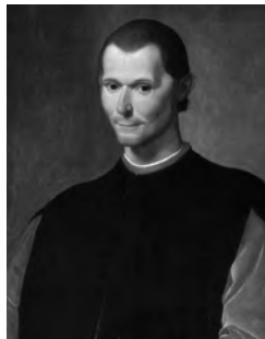
Niccolò Machiavelli Painting by Santi di Tito.

To this day, Niccolò Machiavelli's The Prince remains one of the most influential books of all time. In his short but shocking work, Machiavelli offers a candid, unvarnished treatise on the best ways to seize and maintain political power. He argues that the most successful prince is one who is willing to set aside morality, act with ruthlessness and even embrace violence to achieve his political ends.