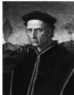
Piero Soderini Painting by Ridolfo Ghirlandaio.

And yet, Machiavelli's own career was not spent advising tyrants but rather defending and upholding one of Italy's most proud republics. In the early 1500s, Italy was not a unified nation but a collection of often warring city-states, each with its own form of government. Unlike Milan and Naples, which were ruled by despotic dukes and kings, Florence had a tradition of drawing its governing officials from the State's most prominent families. Machiavelli was one of Florence's highest-ranking political advisers and diplomats, a position he achieved by the age of 28.