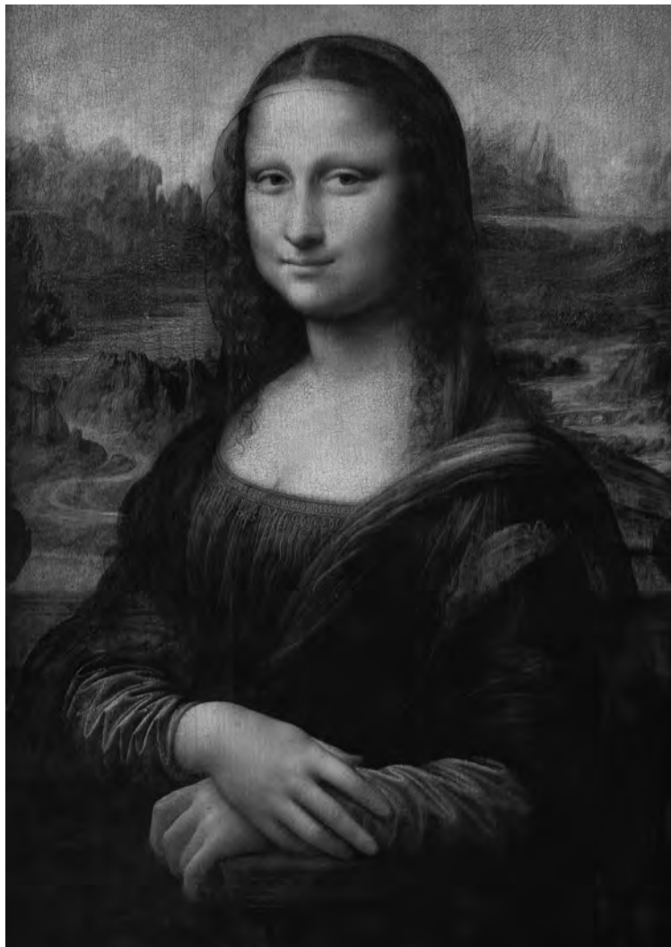
"Mona Lisa" (1503-1519) by Leonardo da Vinci, housed in Musée du Louvre in Paris.