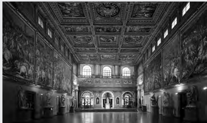
The Salone dei Cinquecento (Hall of the 500) in the Palazzo Vecchio in Florence, where Michelangelo and da Vinci painted their works and where Vasari's frescos now stand.